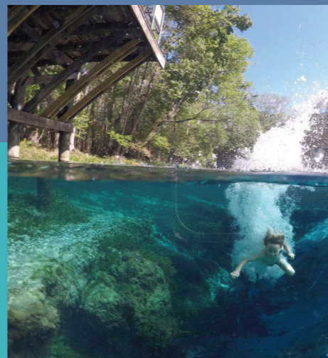
Gilchrist Blue Springs