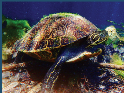
Madison Blue Spring

Learn more by visiting MyHomeMySprings.org .