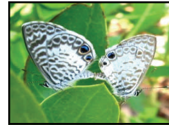
Cassius Blue Leptotes cassius theonus