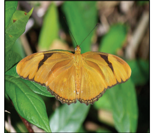
Julia Butterfly Dryas iulia largo