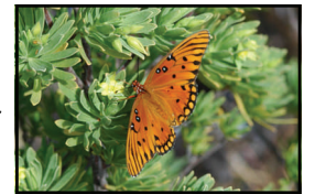
Gulf Fritillary Agraulis vanillae nigrilor