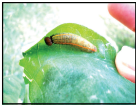
Hammock Skipper Polygonus leo savigny