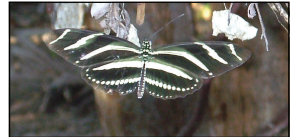
Zebra Longwing Butterfly Heliconius charitonius tuckeri Florida's State Butterfly

Dagny Johnson Key Largo Hammock Botanical State Park