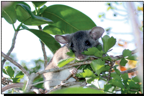
Key Largo Woodrat

Once a dominant habitat type in the Florida Keys and southern tip of Florida's peninsula, this area has been designated by the State as an "Area of Critical Concern." Tropical hardwood hammocks form a low canopy beneath which is a dense, sometimes impenetrable tangle of shrubs and vines. Hidden in the hammocks are some of Florida's rarest and most beautiful animal life. It is home to 84 protected species of plants and animals, including some of the rarest in the United States: the Schaus' swallowtail butterfly, the Key Largo woodrat, and mahogany mistletoe.