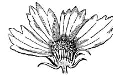
Coreopsis Florida State Wildflower