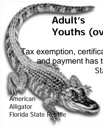
American Alligator Florida State Reptile

Tax exemption, certificate has to be presented at the time of purchase and payment has to be by organizational check and/or credit card State tax is charged unless a tax-exempt number is provided when registering to camp.