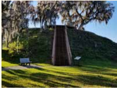
Temple Mound A, the largest mound at the Archaeological site. Observe the salt marsh and Crystal River from the platform or picnic along the river nearby.