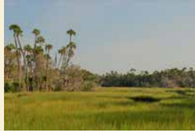
Sabal palm and salt marsh vistas typify a large portion of the preserve.

Archways of palm, pine and oak line this trail that traces the edge of a marsh and ends with canal views. Great for birdwatching or casting a line.