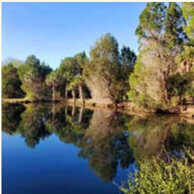
Mullet Hole is a popular fishing destination and features a kayak launch.