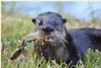
River otters are often seen along the 7-mile loop trail.

Bring water, camera and binoculars. This trail transforms around each turn as it crosses three tidal creeks, passes through pine forest and presents stunning vistas of the salt marsh. Sections of trail may be seasonally wet.