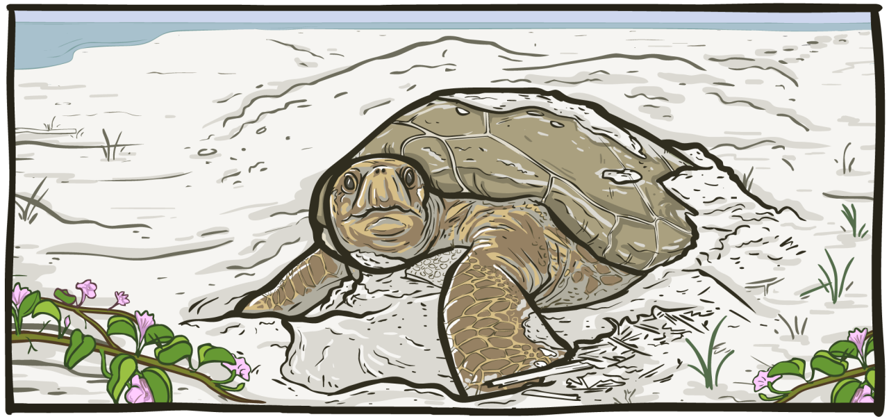
Nesting Sea Turtle (Loggerhead)